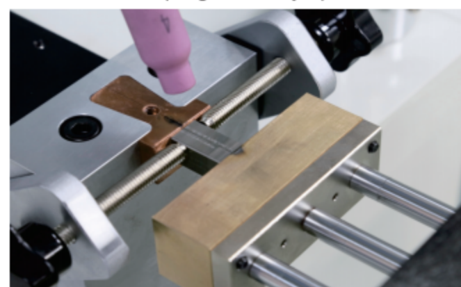
自动气缸定位 Cylinder fixed