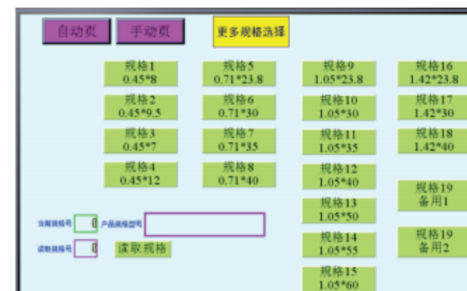
20种刀材可选择 20 types spec for choice